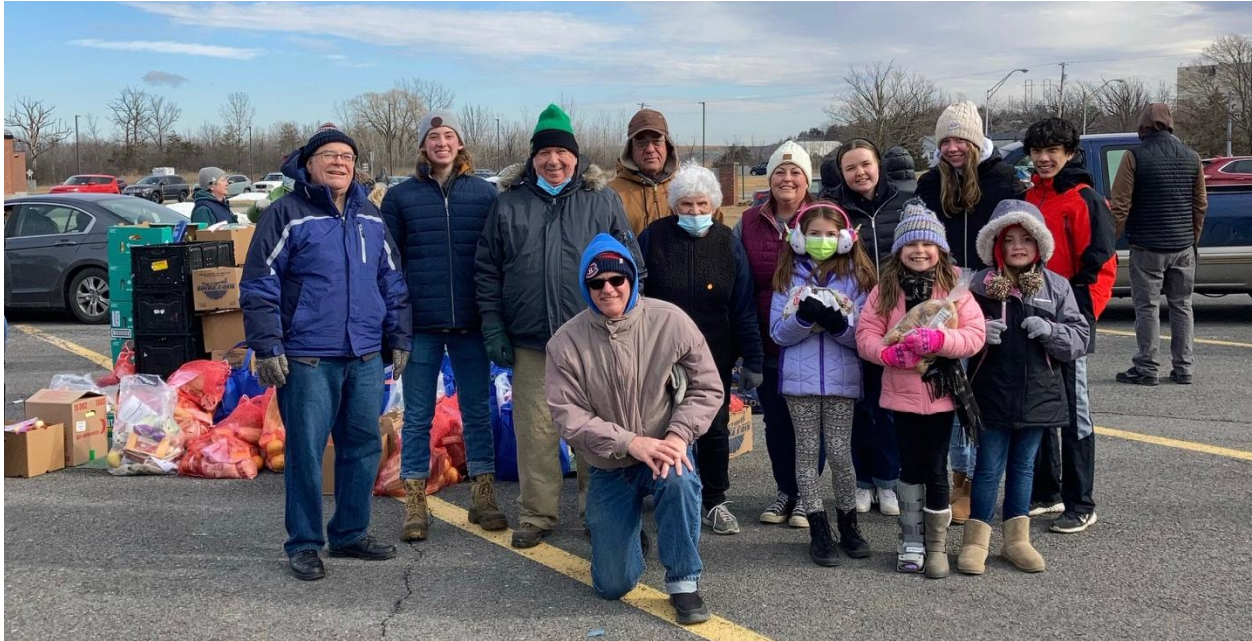
Figure 1. Our helpers for Catholic Charities Food Distribution at RCS. Thank you all for your help!